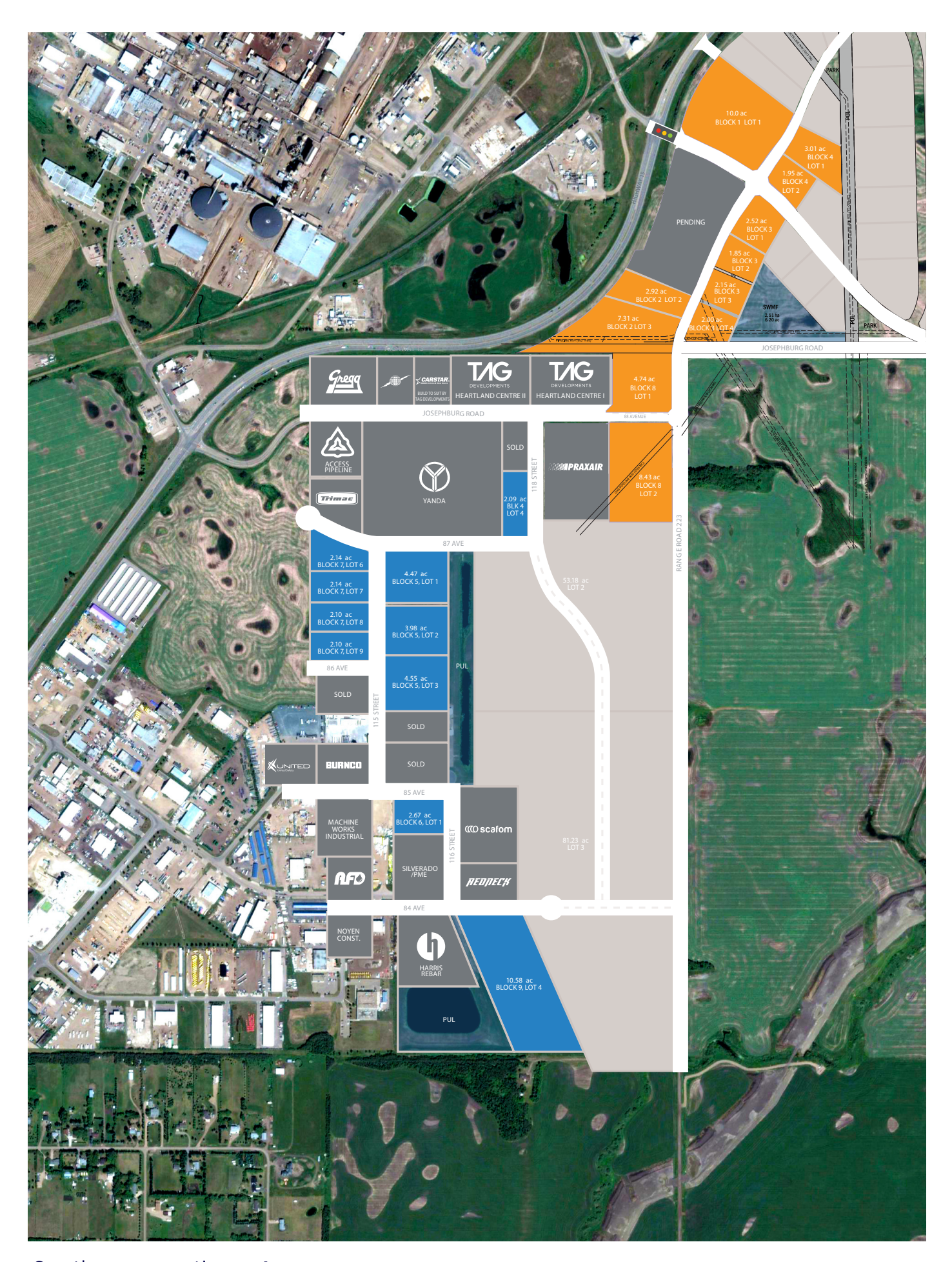
See these properties on tag.ca