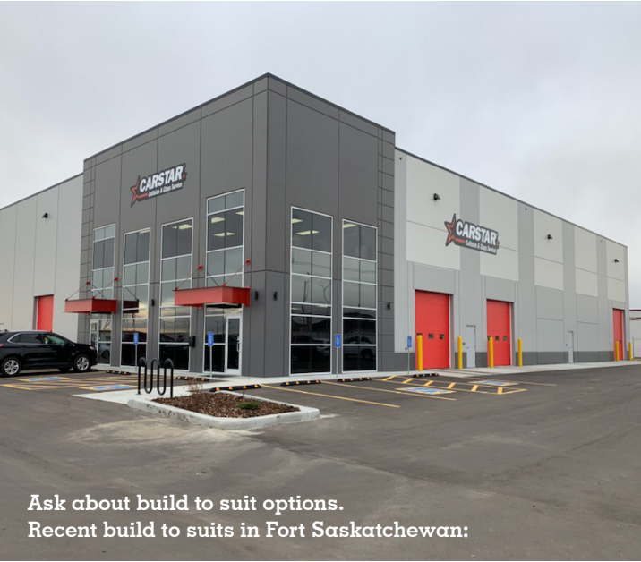
Ask about build to suit options. Recent build to suits in Fort Saskatchewan:

Closest serviced industrial land to Dows recently announced $10 billion petrochemical net-zero emissions plant expansion