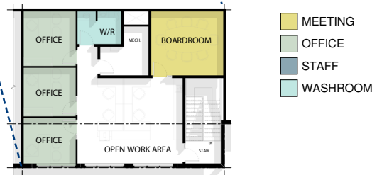
2 Storey Addition