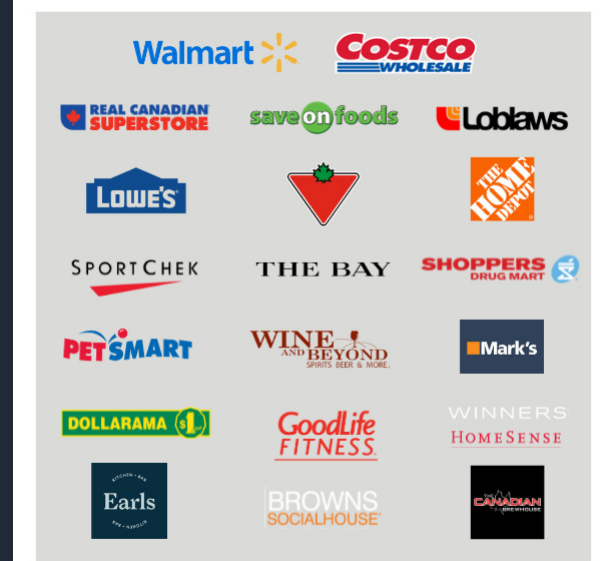
St. Albert Amenities