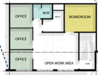
2 Storey Addition

FLEXIBLE BUILD OUT OPTIONS Landlord will build to suit